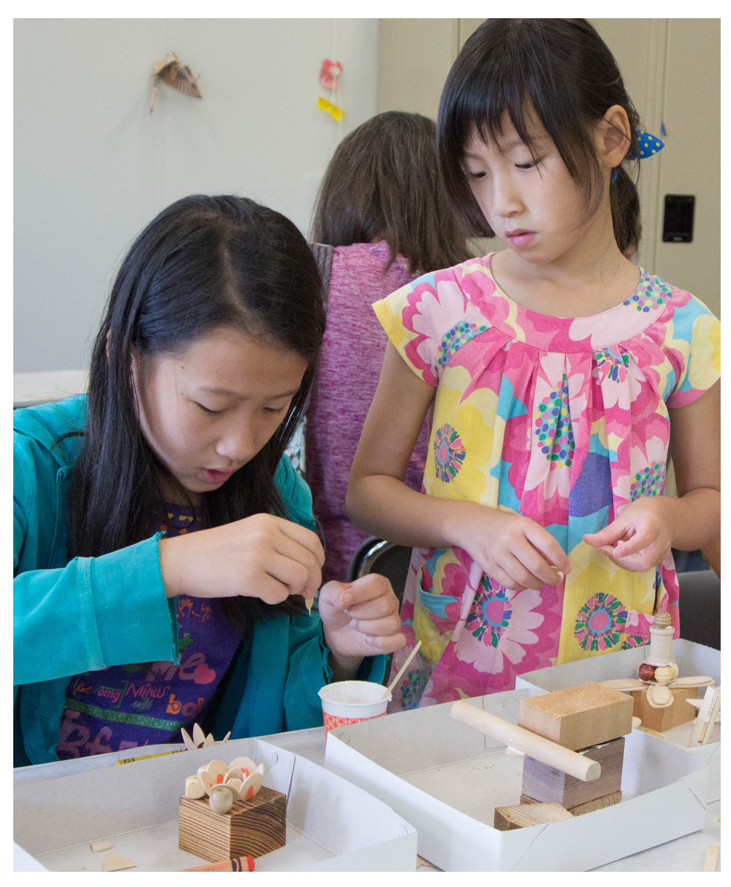
Georgia Museum of Art Annual Report July 1, 2015-June 30, 2016